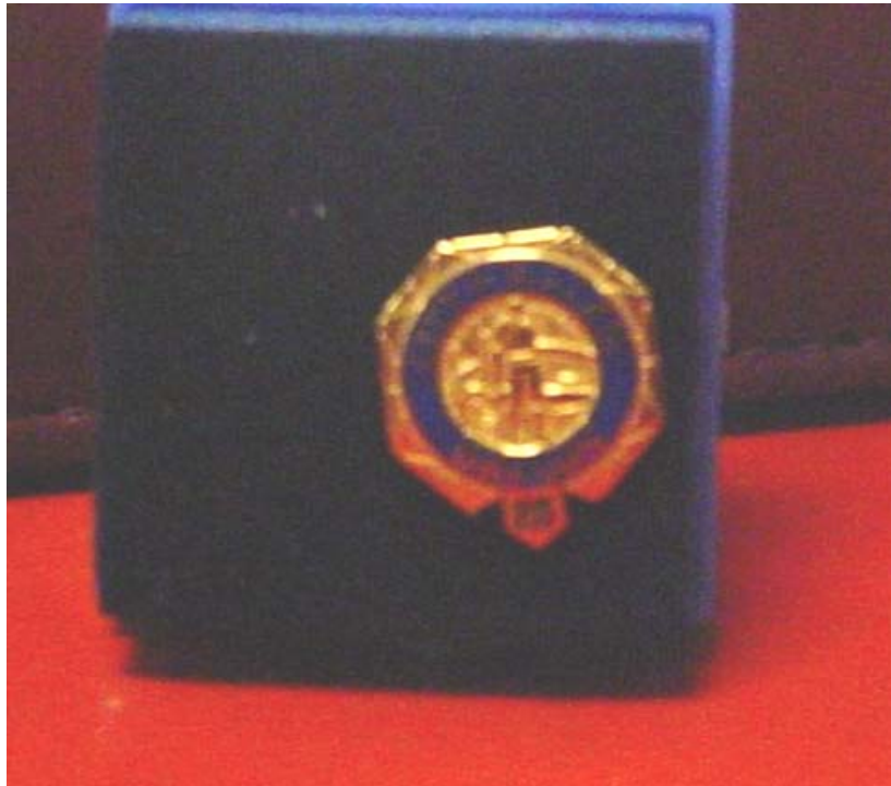
Item: Pin w/length of service Eligible: Service of 10 + Years