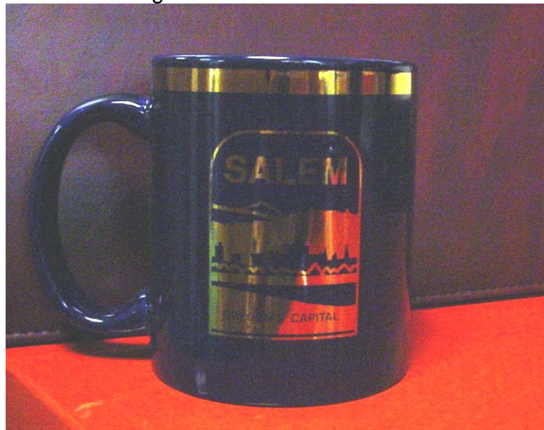
Item: Coffee Mug Eligible: Service of 10 + Years