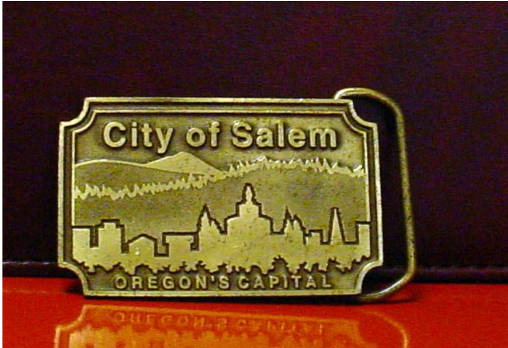
Item: Belt Buckle Eligible: Service of 10 + Years