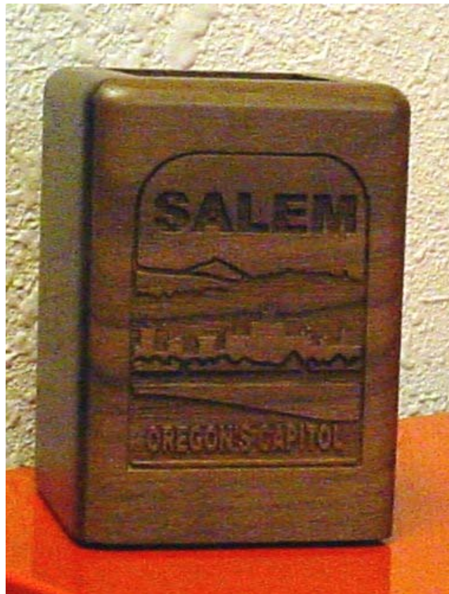
Item: Pencil/Pen Holder Eligible: Service of 10 + Years

The following are pictures of the award items.