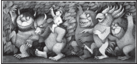
Final drawing for Where the Wild Things Are , © 1963 by Maurice Sendak, all rights reserved.