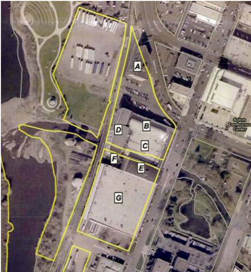
Figure 1. Existing Boise Cascade Site Buildings

The site contains numerous structures as shown in Figure 1.