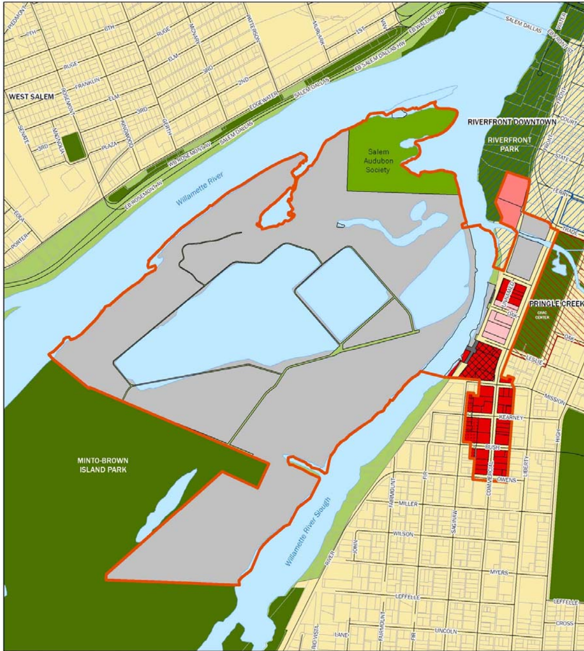
Figure 2. Zoning