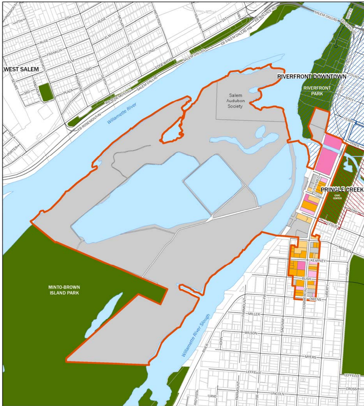
Figure 3. Improvement to Land Ratio