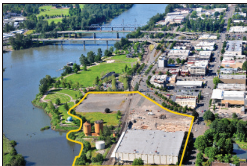
Aerial of the Boise Redevelopment Site Within SWURA.

To realize the ULI vision for the property, the City developed the South Waterfront Urban Renewal Area property and its vicinity, and initiated a change from the predominantly industrial zoning of the property to a river-oriented, mixed-use designation. Bound by Front and Commercial Streets and the River, the City has prepared the area for redevelopment by establishing a new mixed-use zone (January 2009).