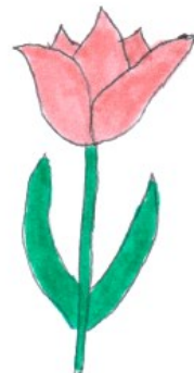
Flower in Bloom