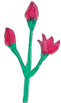
Plant with Buds