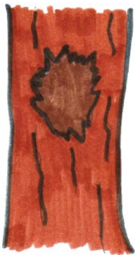
A Tree Cavity (Hole)