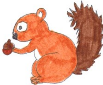
Bird or Squirrel Eating or Playing