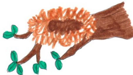
Nest in a Tree