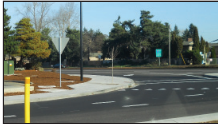
Hyacinth Road - Spring 2014