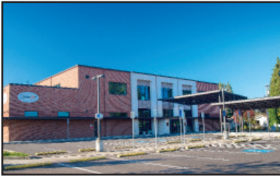
Center 50+ - October 2008