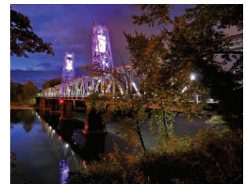
Union Street Railroad Bridge