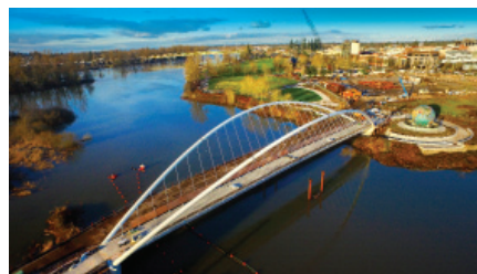
Minto Bridge Construction February 2017

Scheduled for completion August 2017, the 300 ft. long, tied arch pedestrian bridge will connect downtown Salem to Minto Island and complete a long-standing community vision of connecting three major urban parks and a network of more than 20 miles of trails.