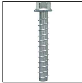
SK-2 (TITEN SCREW)