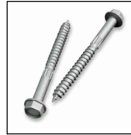
SK-3 (SDS SCREW)