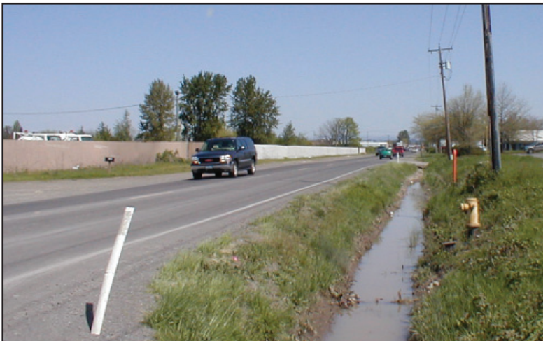
Existing Infrastructure - McGilchrist Street

The primary obstacle to development in the Area has been the substandard condition of McGilchrist Street and its intersections with the major north/south streets serving the Area (12th Street, 13th Street, Pringle Road, 22nd Street, and 25th Street).