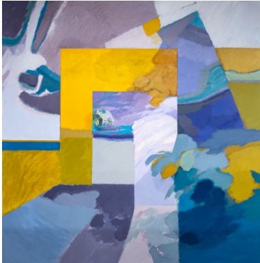
Extra-Terrestrial - Tom Cappuccio